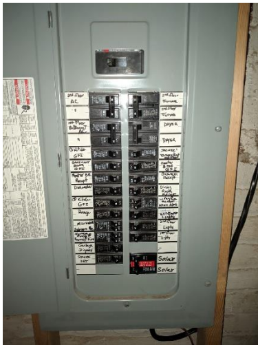
(Main panel legible breakers)