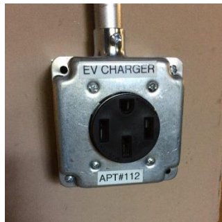
(A NEMA 14-50 outlet for EV Charging)